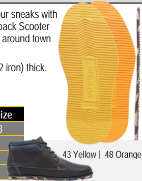
43 Yellow | 48 Orange