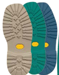
32 Grey | 37 Green | 39 Blue