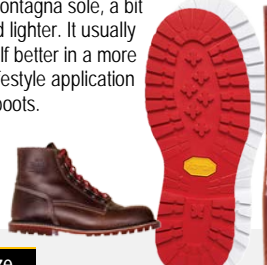
24 Red 26 White